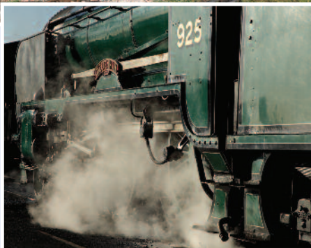
With lovely winter light reflecting off the locomotive, 925 "Cheltenham" waits for its next duty.