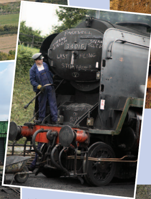
Left: The chalked slogans on the front of 34016 add to the authentic end of Southern steam atmosphere.