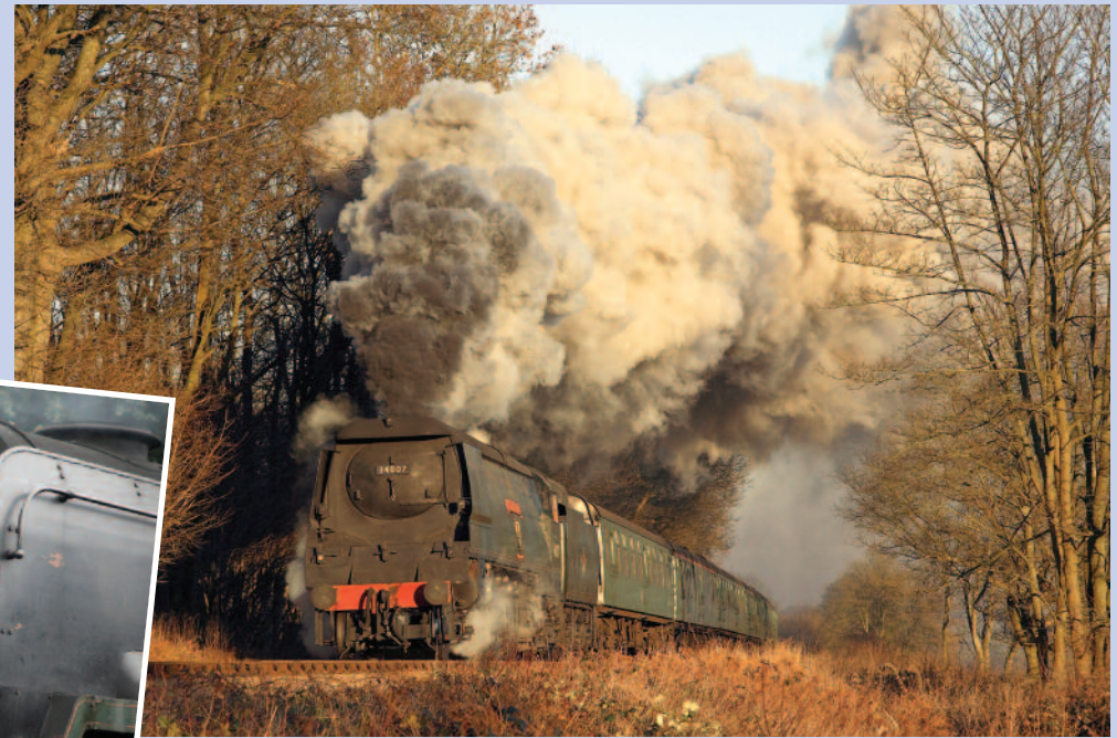
Above: Taken on Boxing Day, the great smoke effects and the last of the winter sunshine create a very dramatic scene with 34007 "Wadebridge" in charge.